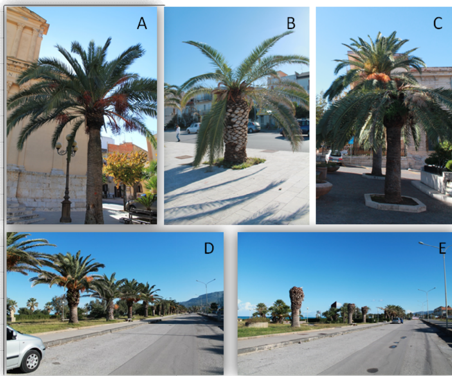
Figure 1 (A-E): Phoenix canariensis at different levels of infestation: (A) early symptoms; (B) symptomatic palm with loss of symmetry of the leaves of the canopy; (C) late symptoms on a plant with the leaves dried and hanging downward in a typical 'umbrella shape'; Sant'Agata di Militello main road at the beginning (D) and at the end (E) of the monitoring period of the study.

At the start date, 23 rd November 2013, the number of killed and symptomatic palms was respectively 42% and 14% of the total number of trees monitored.