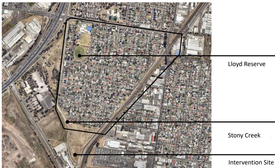
Figure 2: The area under study

Located 12 kilometres west of Melbourne's Central Business District, Sunshine North is an established suburb settled after World War II with a population of more than 11,000 people and an average of three people per household (Australian Bureau of Statistics, 2016). With a median weekly household income of AU$ 882, the area is considered to have low socioeconomic status (Australian Bureau of Statistics, 2016). The study area is a section of Sunshine North bounded by Gilmore Road, Furlong Road and Stony Creek — an urban waterway in Melbourne's western growth corridor that runs through Sunshine North (Fig. 2).