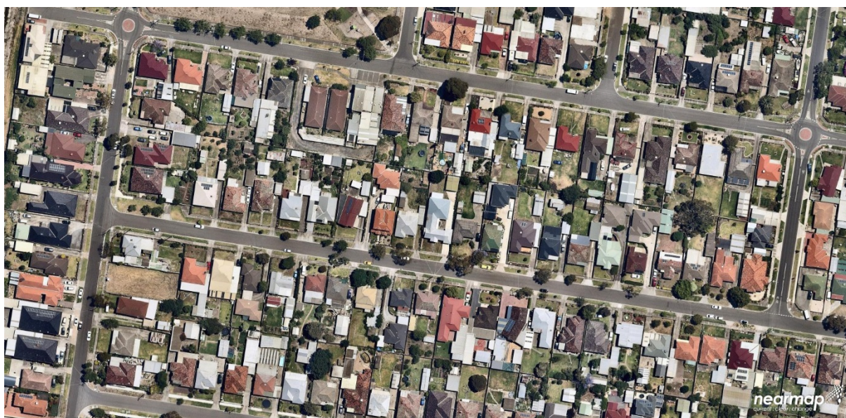
Figure 3: Large plots of land with gardens

A professional transcription service transcribed the interviews' audio recordings and these were imported into Nvivo (qualitative analysis software) for analysis. For the purposes of this paper, the analysis focused on identifying patterns of use and perceptions of greenspaces and private gardens in Sunshine North. Thematic analysis of the interviews facilitated coding of responses into a range of topics.